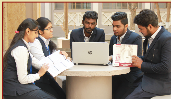
Wifi enabled Campus