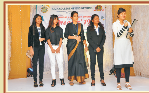
Event : Corporate Show