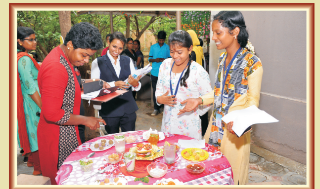
Event : Fireless Cooking