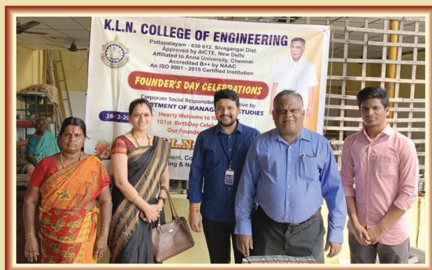
CSR Initiated by Students