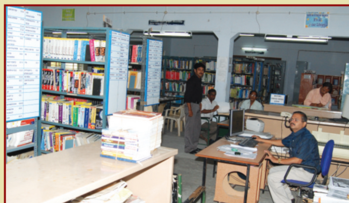
MBA Library with OPAC