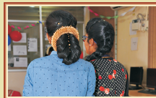
Event : Hair-Do