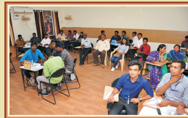
Event : IPL Auction