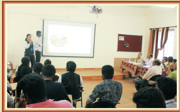
Presentation by MBA Students