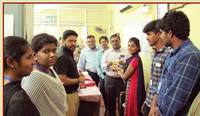
Our MBA Students Won Overall Winners Trophy And Certificates In Management Meet