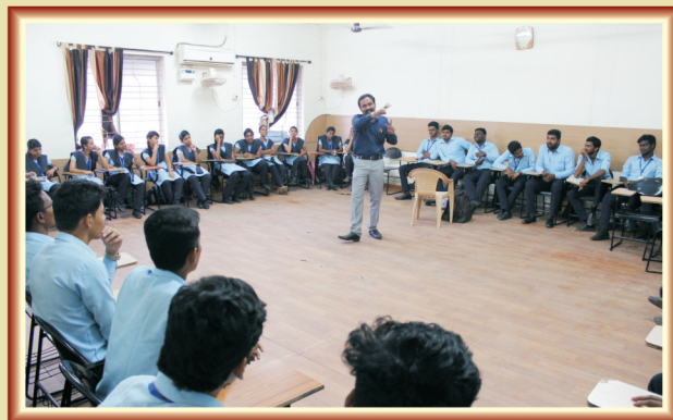
Personality Development Programme