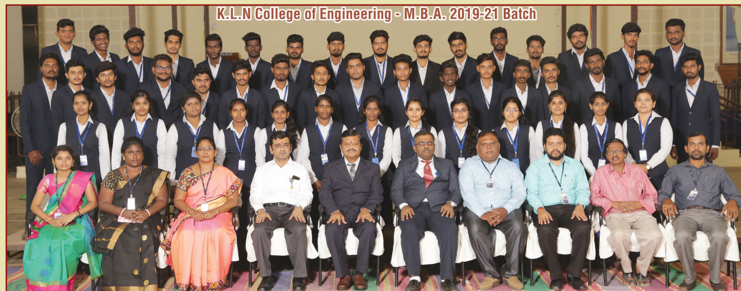
MBA Students with Faculty Team