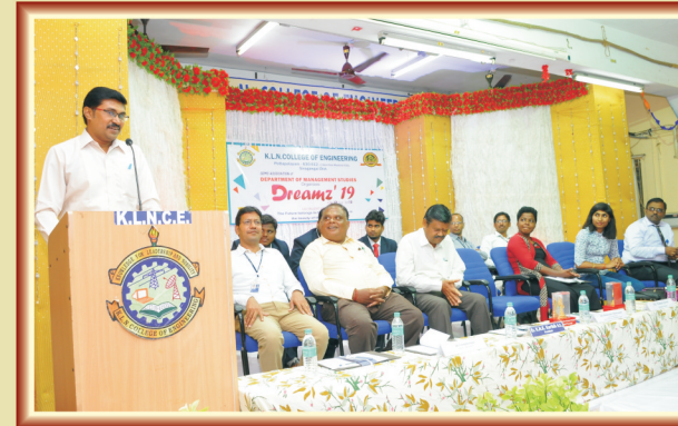
Chief Guest Addressing the Students