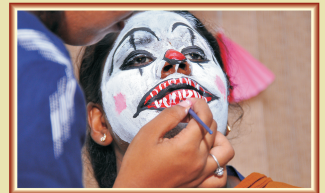
Event : Face Painting