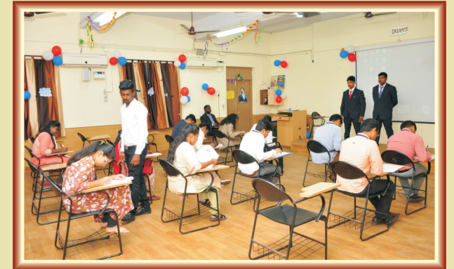
Event : The Spartans