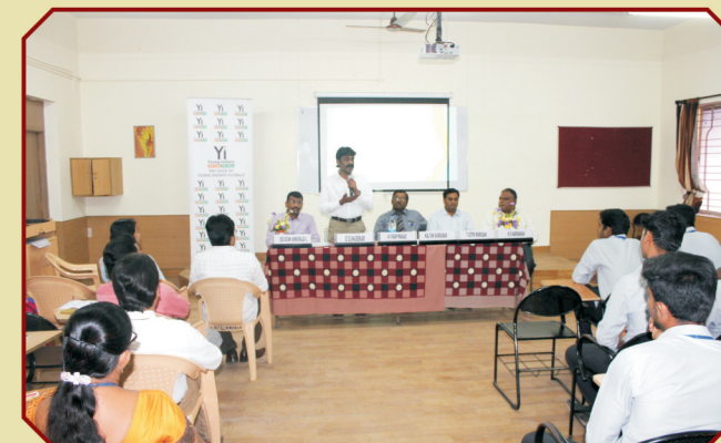
CII - Young Indians