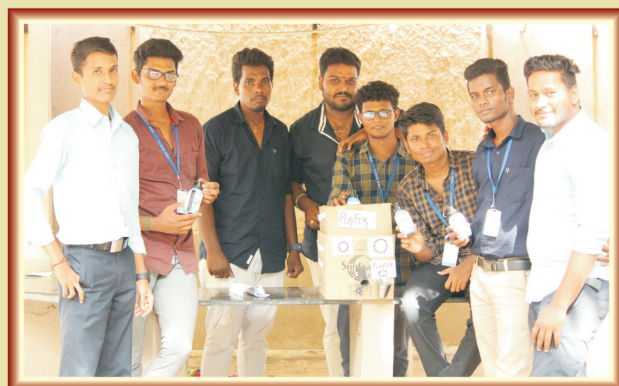
Activity based Training