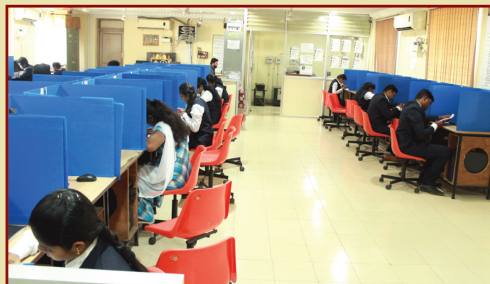
MBA Computer Lab